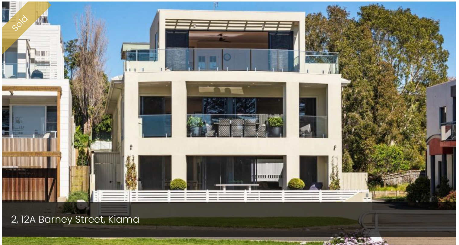
2, 12A Barney Street, Kiama